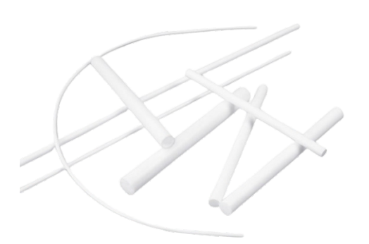
PTFE Extruded Rod