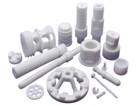
PTFE Machined Components