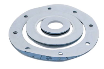
PTFE Envelope Gasket