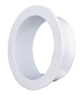
PTFE Nozzle T Bush