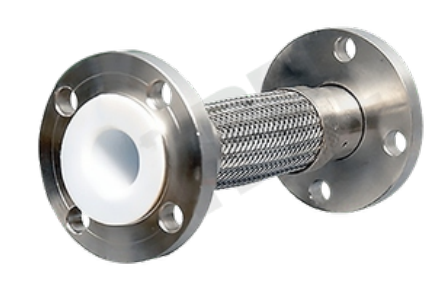
Lined Hose Pipe