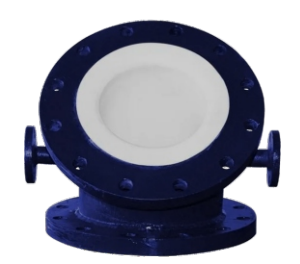
Jacketed 90° Elbow