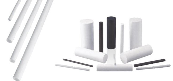
PTFE Extruded Tube