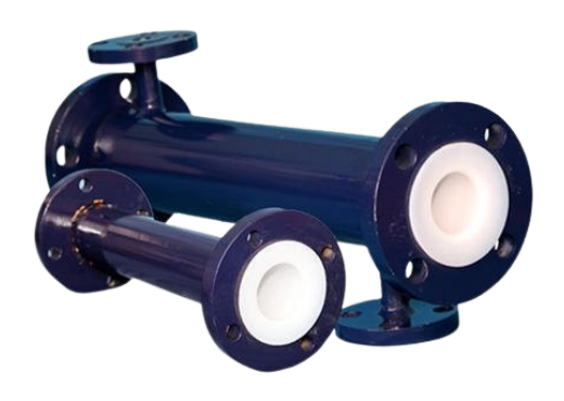
Jacketed Lined Pipe