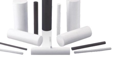
PTFE Moulded Rod