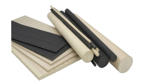
PEEk Rod & Sheet