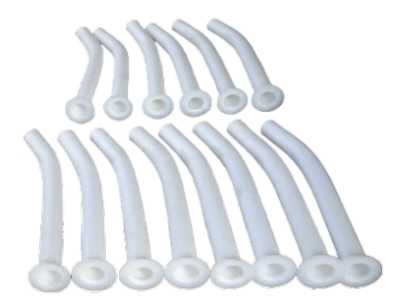
Pure PTFE Feed Pipe