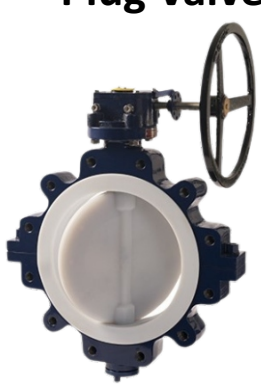
Lined Gear Operated Butterfly Valve