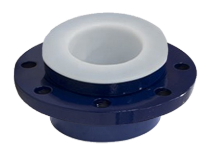
Spacer Type 2