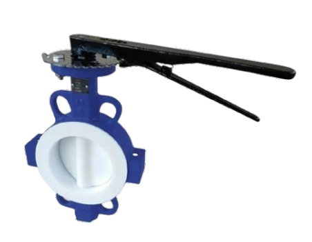
Lever Operated Lined Butterfly Valve