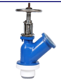
Lined Flush Bottom Valve