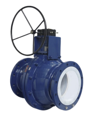
Lined Gear Operated