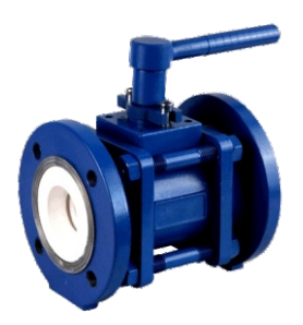
Lined Plug Valve