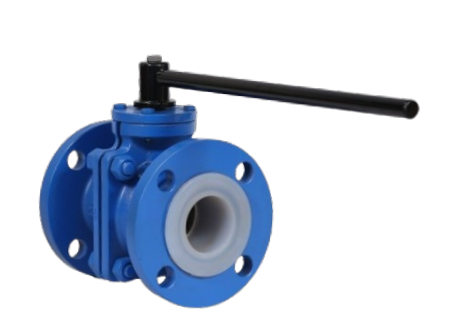
Lined Ball Valve