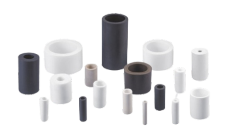
PTFE Moulded Bush