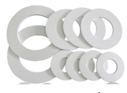
PTFE Cut Gasket