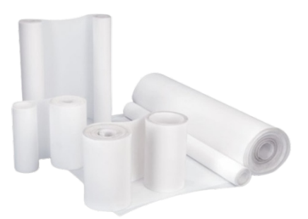
PTFE Skived Sheet