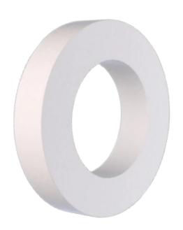
Spacer Type 1